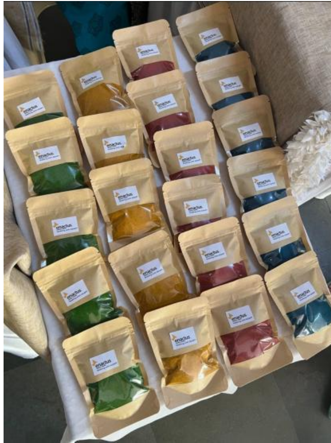
Rangoli Colour Packets Prepared