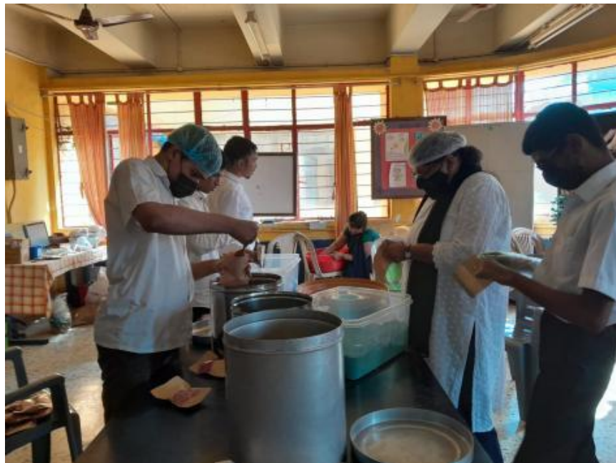
Preparation of the Rangoli Colors