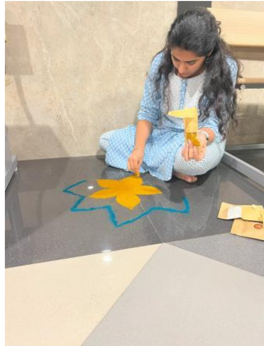
Rangoli prepared by the Enactus Team outside the Administration areas and Department office on the 2nd floor of ASMSOC.